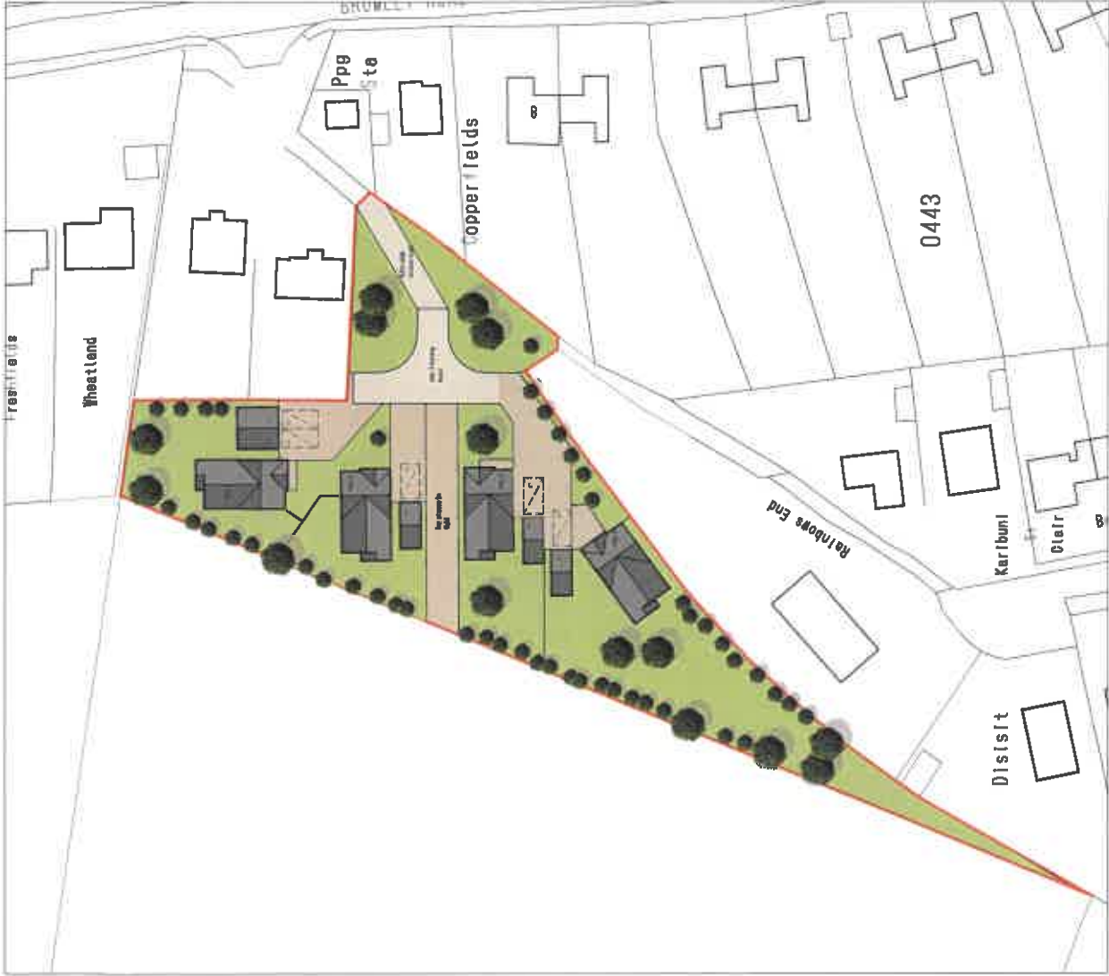
Site Plan 1:500