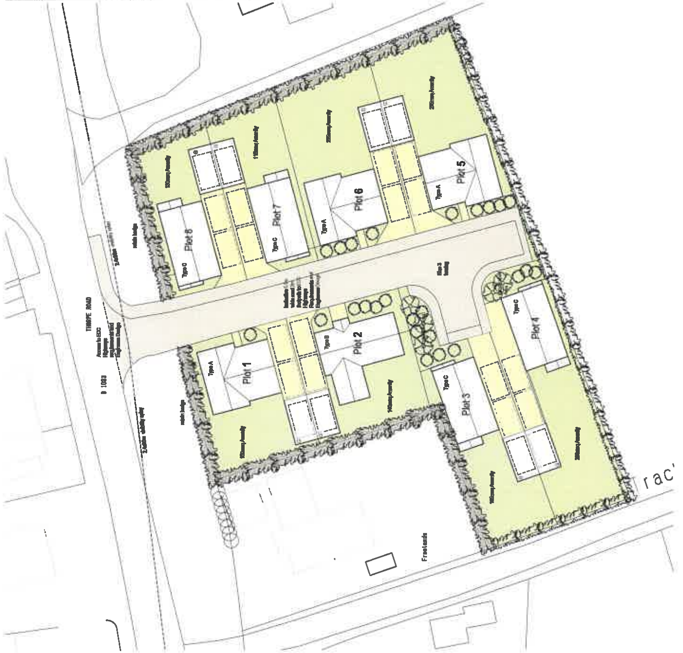
Site Plan 1:200